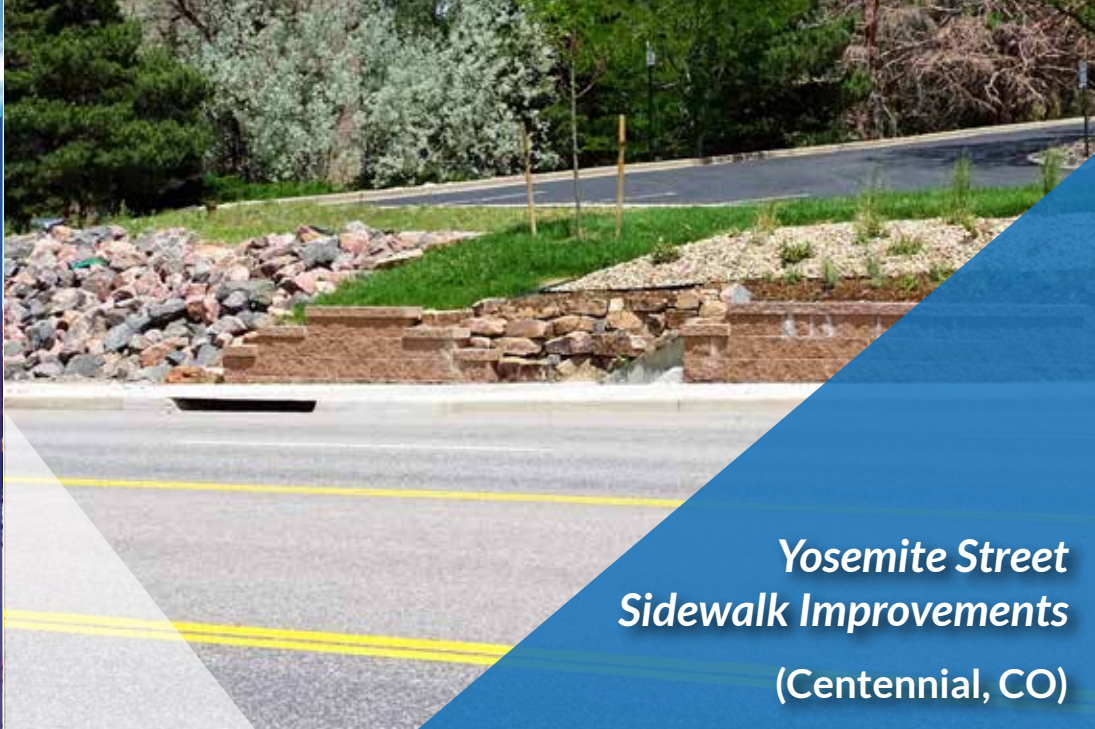
Yosemite Street Sidewalk Improvements (Centennial, CO)