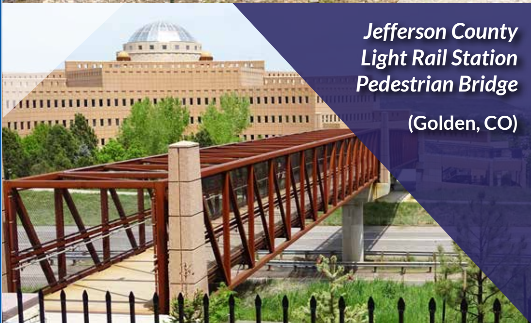
Jefferson County Light Rail Station Pedestrian Bridge (Golden, CO)