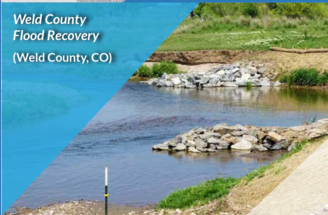
Weld County Flood Recovery (Weld County, CO)