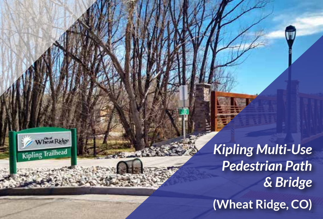
Kipling Multi-Use Pedestrian Path & Bridge (Wheat Ridge, CO)

Engineering Spatial Data Advanced Technologies